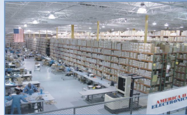
Inside one of America II Electronics' warehouses in St. Petersburg, Florida