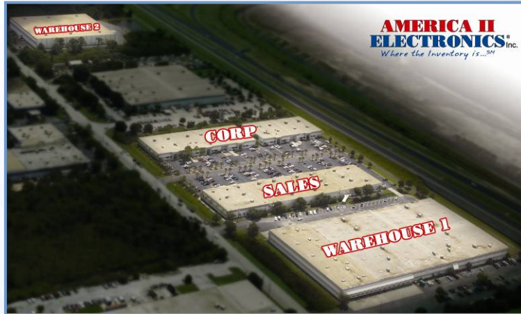
Aerial view of America II Electronics' headquarters and distribution facility in St. Petersburg, Florida